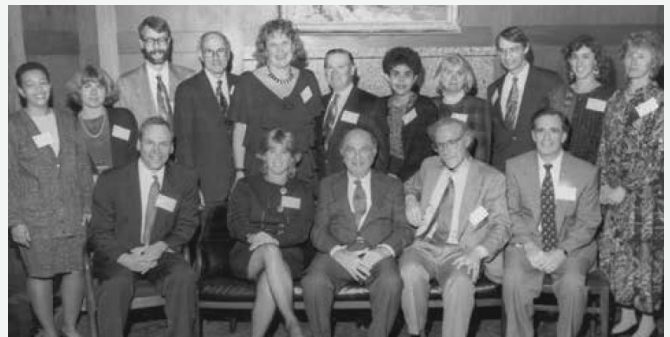
Former Hays Fellows who were in academia as of 1993